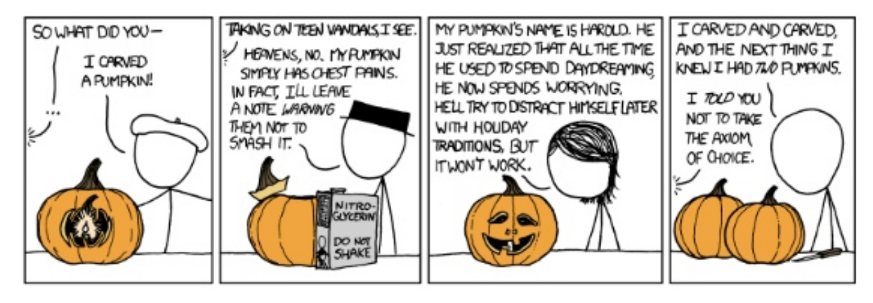
http://xkcd.com/804/ \\ (All the other hangman comics seemed a bit too morbid...)