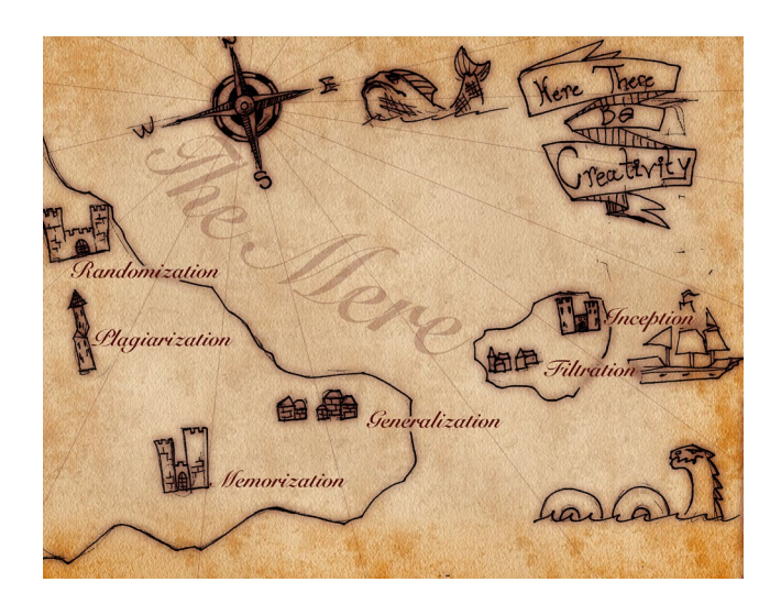
Figure 2: A spectrum of generative systems. The threshold beyond which our systems are no longer merely generative lies somewhere, but it is not clear where. Even more concerning, as our systems become more sophisticated and we progress farther afield, we as a community may continue to insist that the threshold is just beyond our currently charted territory. (Original artwork courtesy of Krey Ventura.)

The journey of generation that we have just taken is illustrated in Figure 2, with the stochastic system defining one extreme of the spectrum, while the other is left undefined. The ordering of the various approaches and the relative spac-