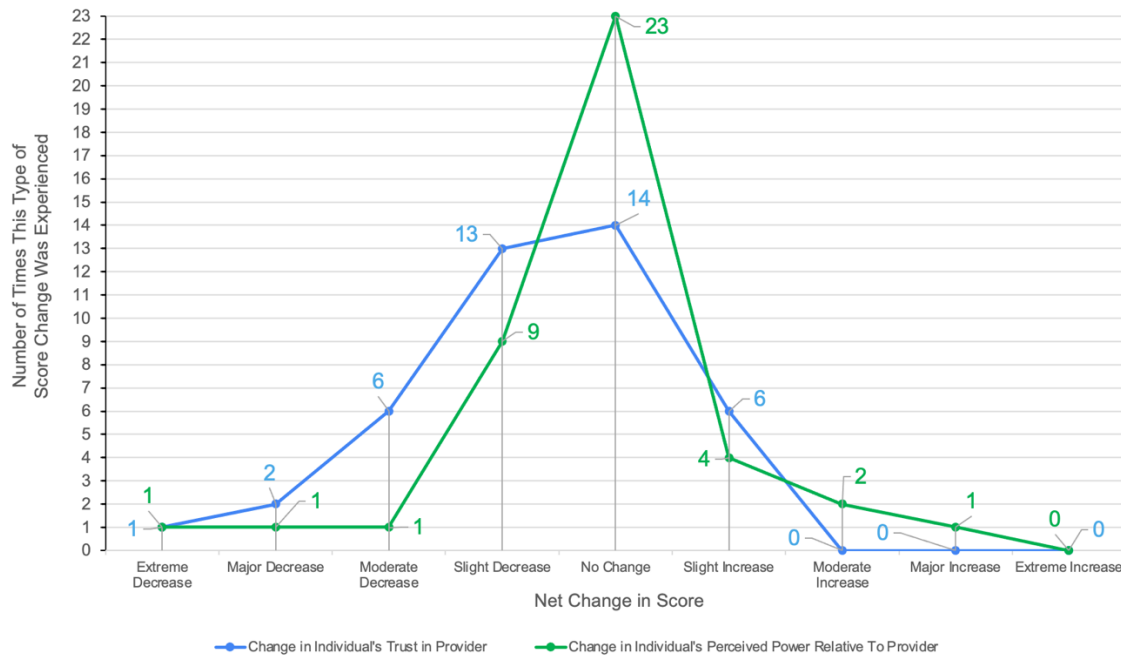
Figure 4: Distribution of Net Changes in Participant's Perceived Power and Trust Scores over the Study's Duration

power than her because “they’re making decisions and [I] don’t know how”. Personal data sharing is insufficiently visible to participants: two participants (P3, P4) targeted GDPR requests to credit-check websites (Credit Karma, CheckMyFile) - P4 wanted to get “a picture of what other companies can currently expose”.